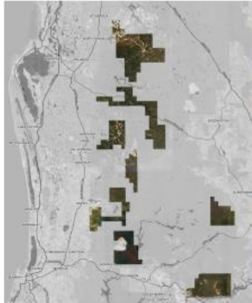
Rio Tinto new mining applications