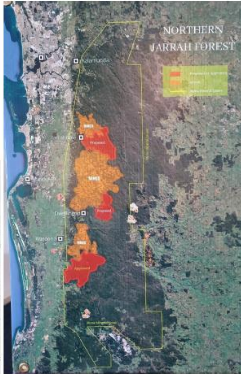
Alcoa mining & expansion