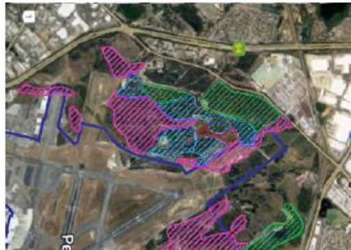
Perth Airport 'North' Major Development Plan on 'Priority' Conservation and Heritage sites