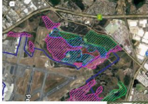
Perth Airport 'North' Major Development Plan on 'Priority' Conservation and Heritage sites